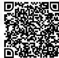
NUAA Application Portal